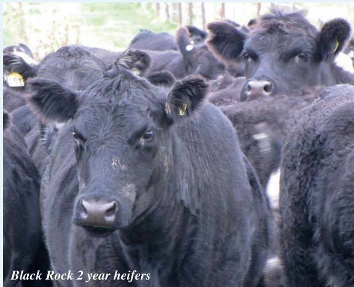
Black Rock 2 year heifers

Our final selection is based on type (feet/legs/fleshing etc) ....the genes were selected three years ago at breeding.