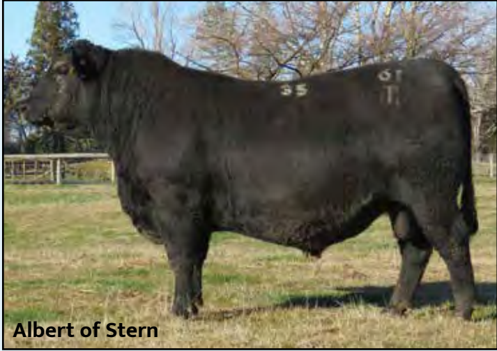
Albert of Stern

A huge thank you to all bidders and under bidders who made our 2021 sale a record breaker! We always want quality to be the determining factor of how many bulls we put up each year, last year we put eighty odd bulls through the ring (down from 95 in 2020) for an amazing average of over $11,500. Six stud bulls averaged over $27,000! Commercial bulls sold from $4,000 to strong repeat and new buyers from across the South Island and into the North.