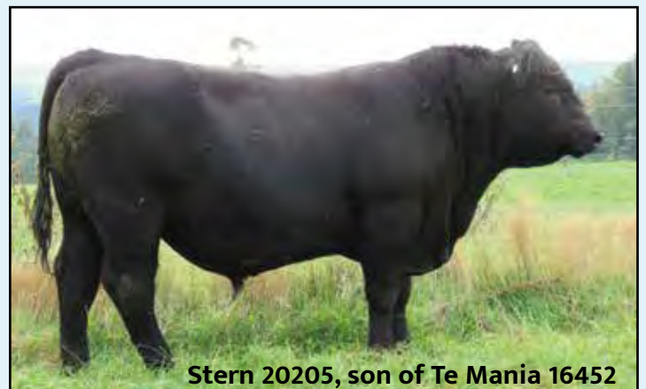
Stern 20205, son of Te Mania 16452

There are also sons of Te Mania 17463 who's progeny were sought after at our Spring yearling sale for their calving ease and carcase attributes. And plenty by top home bred sires.