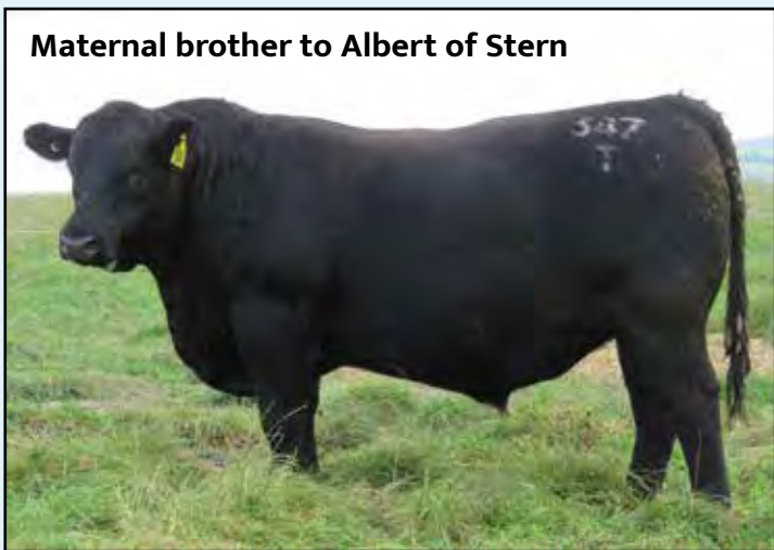
Maternal brother to Albert of Stern

The top price was also a record at $64,000. Albert of Stern was also purchased by Tangihau stud, Gisborne. He was a son of a exceptional bull purchased by Mt Albert Station in 2021.