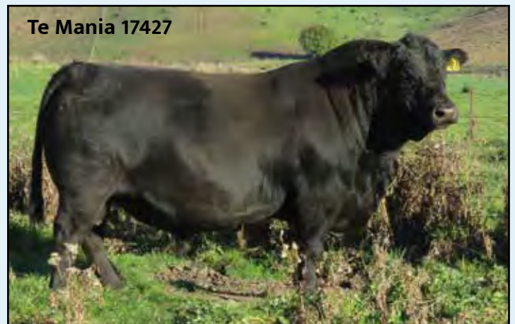
Te Mania 17427

We are very pleased with the way Mackenzie is continuing to breed functional cattle and he has another top line up this year. We have retained an