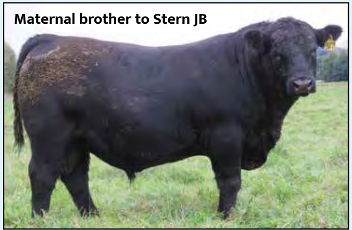
Maternal brother to Stern JB

Following on from our 2021 sale we have maternal half brothers to both JB and Albert. Both with lovely temperament and easy doing ability, both definitely worth a closer look!!