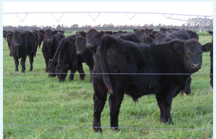
Stern Bred Wieners