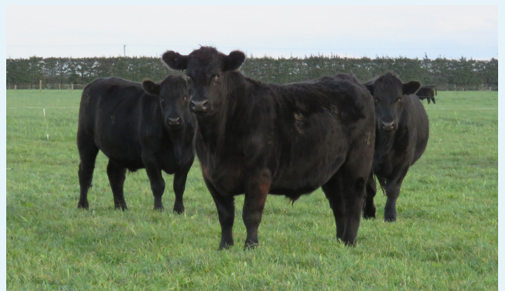
Stern Bred R2 Steers